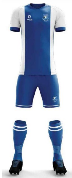
MINDARIE FC 2019 MATCH KIT