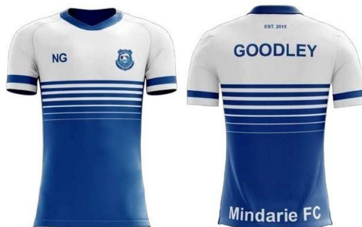
MINDARIE FC TRAINING SHIRT

EMAIL: MINDARIEFC@GMAIL.COM WEBSITE: MINDARIEFC.COM